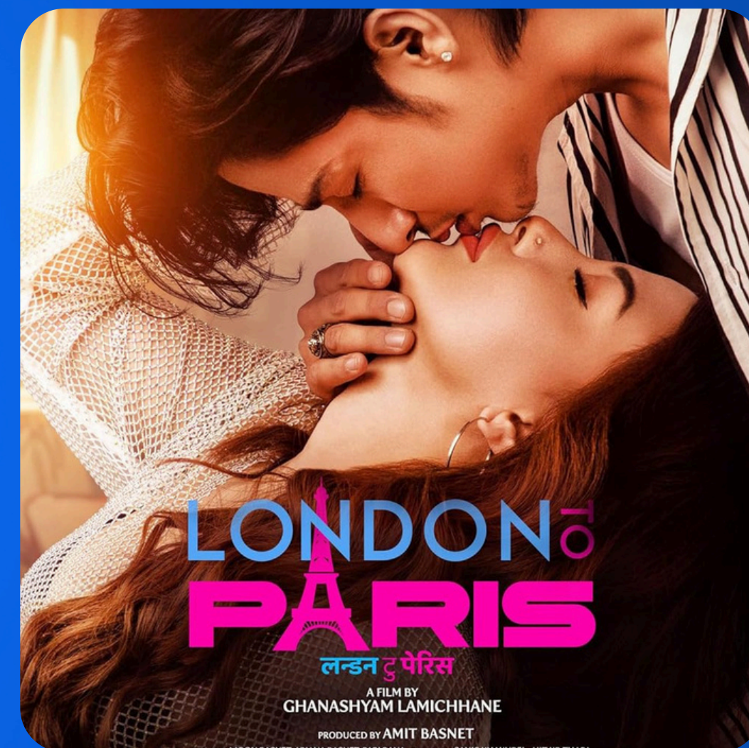
London to Paris