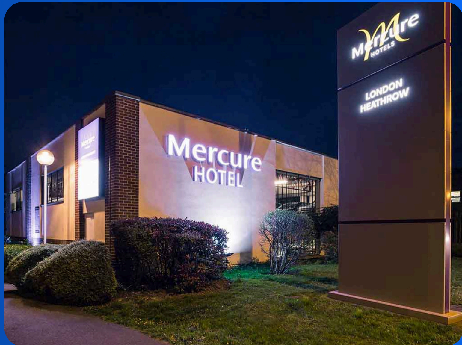
Mercure London Heathrow Hotel