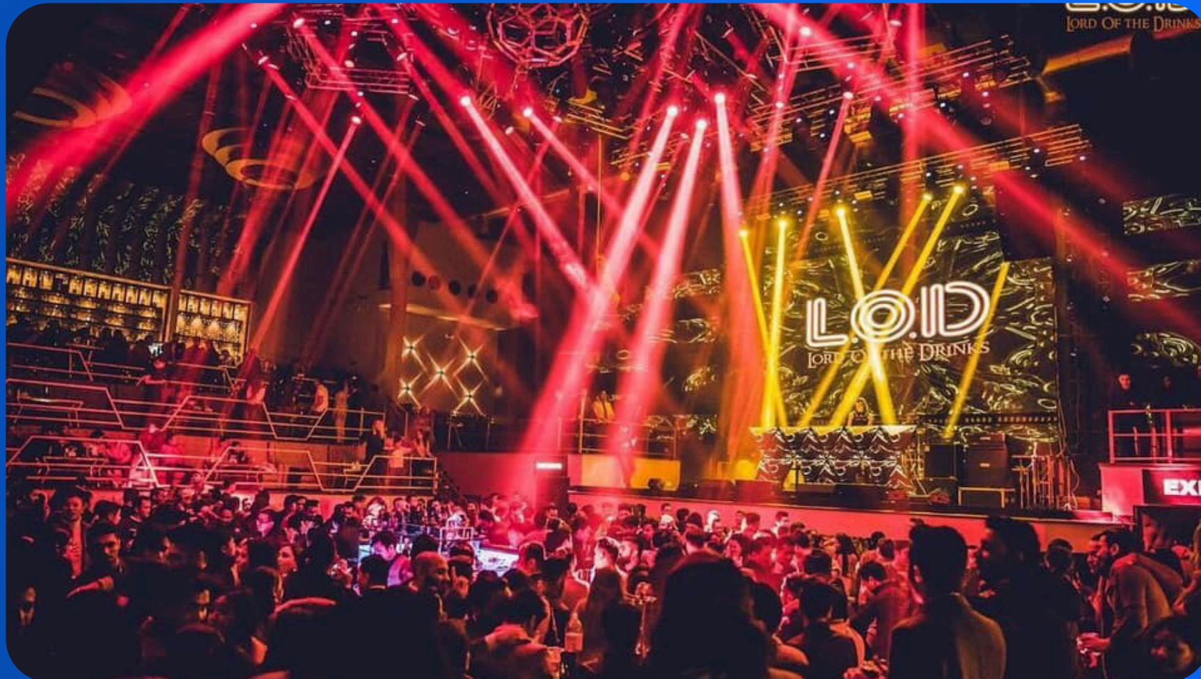
LOD Nightclub, Thamel, Kathmandu