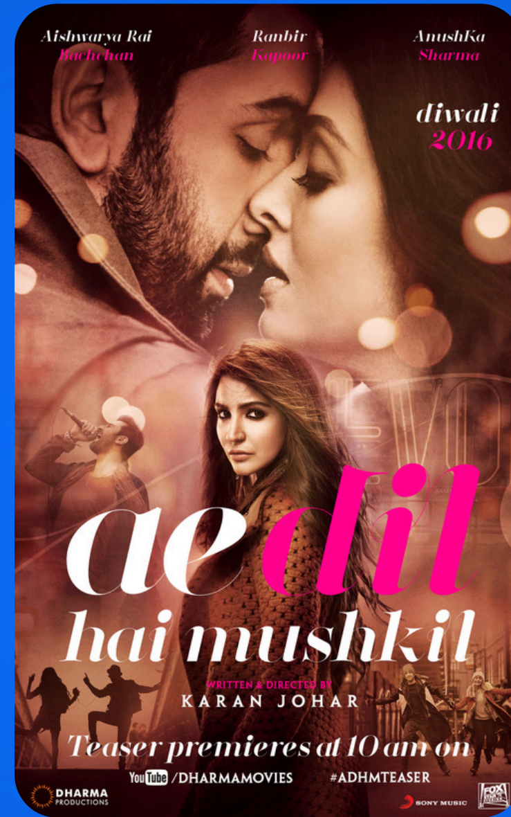
Ae Dil Hai Mushkil (2016)