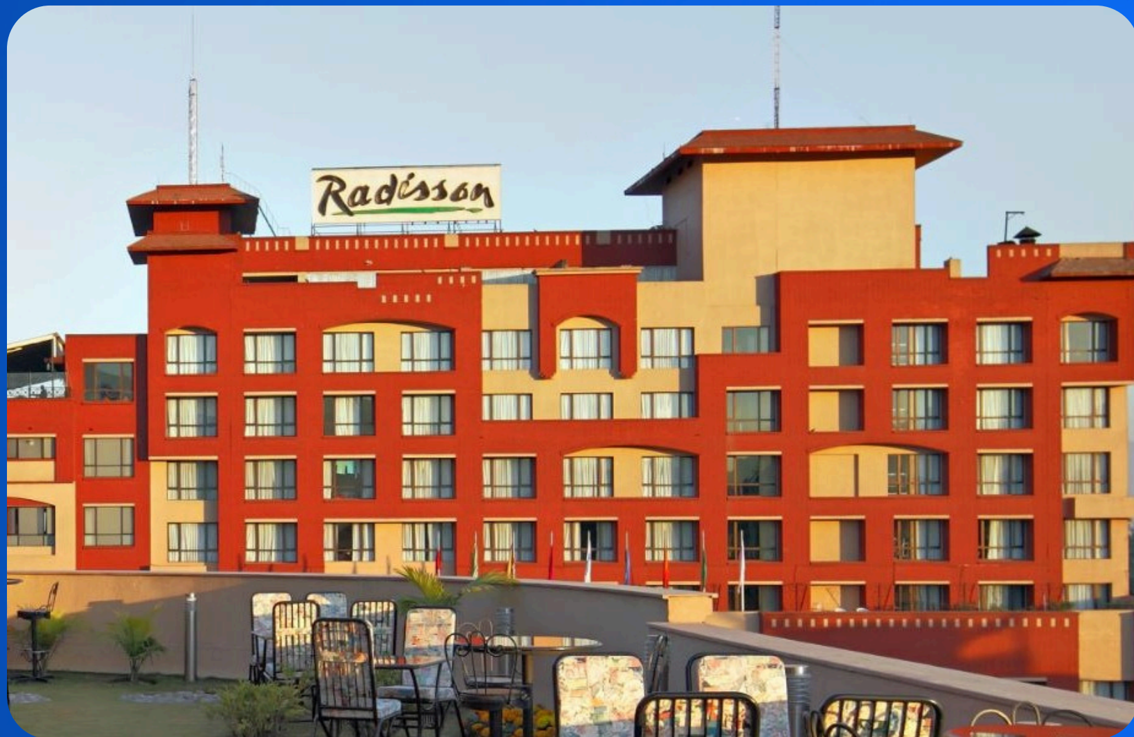
Radisson Hotel Lazimpat, Kathmandu