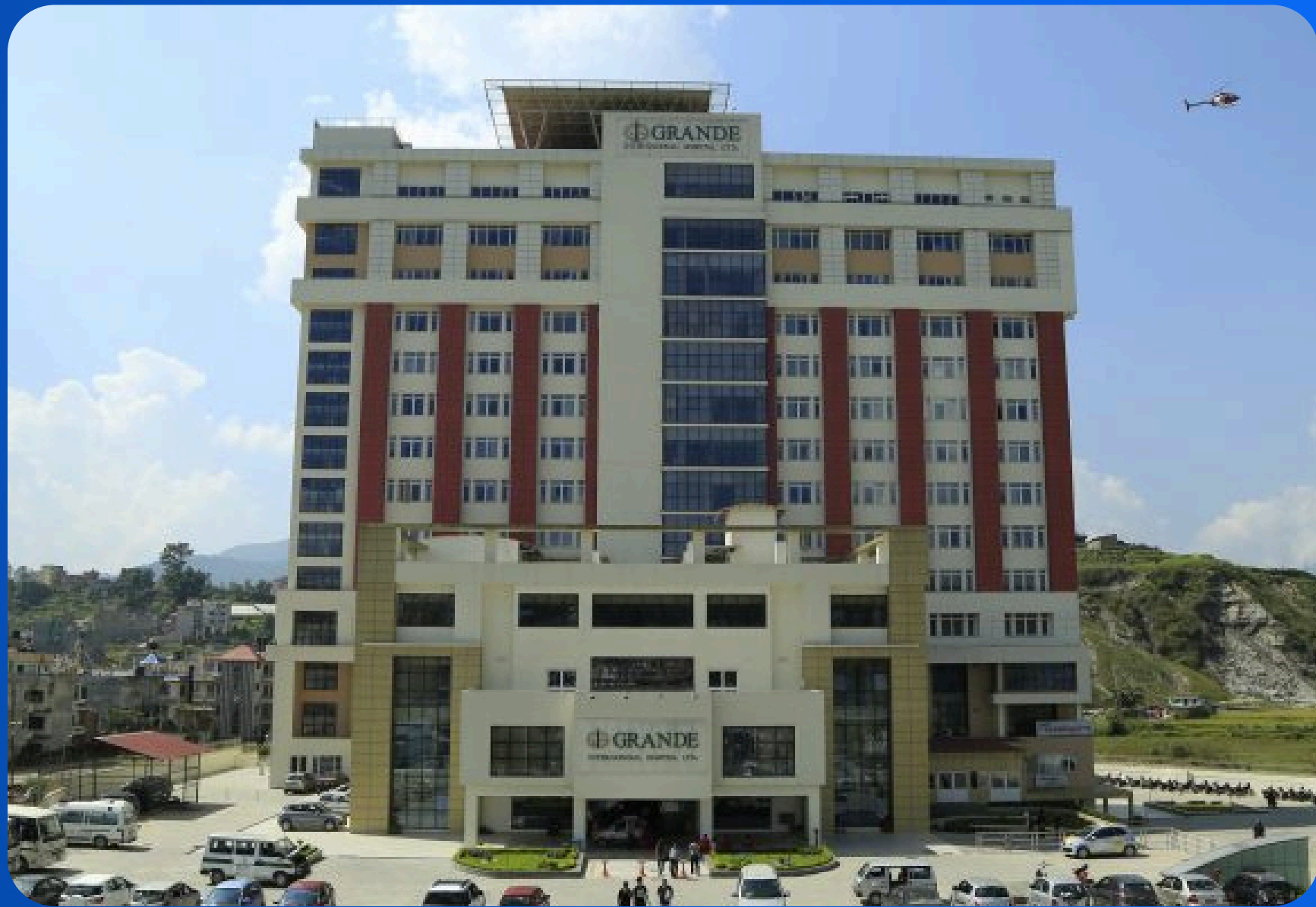
Grandi Hospital, Kathmandu